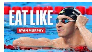
Just for fun! See what Olympian Ryan Murphy eats while training for his 9 practices a week!