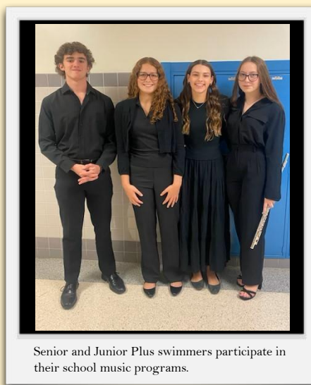
Senior and Junior Plus swimmers participate in their school music programs.

Families are expected to raise $100. This event is held in conjunction with the ExtraGive. We will share our fundraising page and additional details about the event next week.