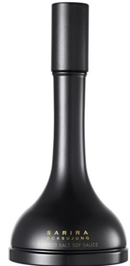
Sarira Bamboo Salt Soy Sauce 100 ml