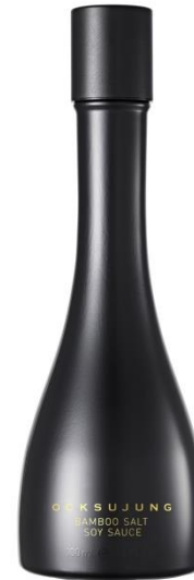
Bamboo Salt Soy Sauce 100 ml