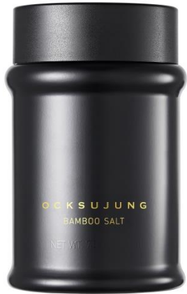
Bamboo Salt coarse 200 g