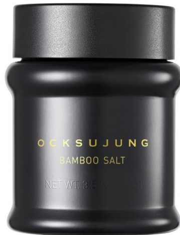
Bamboo Salt fine 100 g